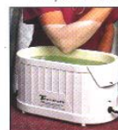
Elbows and More

Since 1962, physicians, physical therapists, arthritis specialists, and athletic trainers have recommended the Therabath® because paraffin therapy is one of the most effective methods of applying heat to relieve pain.