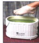
Feet and Ankles